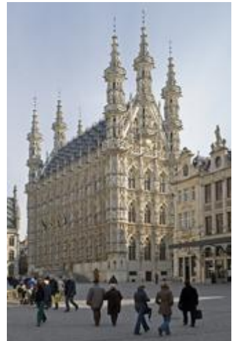
Leuven Town Hall

Welcome to the cosy city of Leuven. Leuven is the capital of the province of Flemish Brabant, one of the 10 provinces of Belgium. Leuven counts ca 100.000 inhabitants and more than 30.000 university students, who study at one of the world's oldest Catholic Universities. The university hospital UZ Leuven is not only Belgium's largest, but also well renowned all over the world.